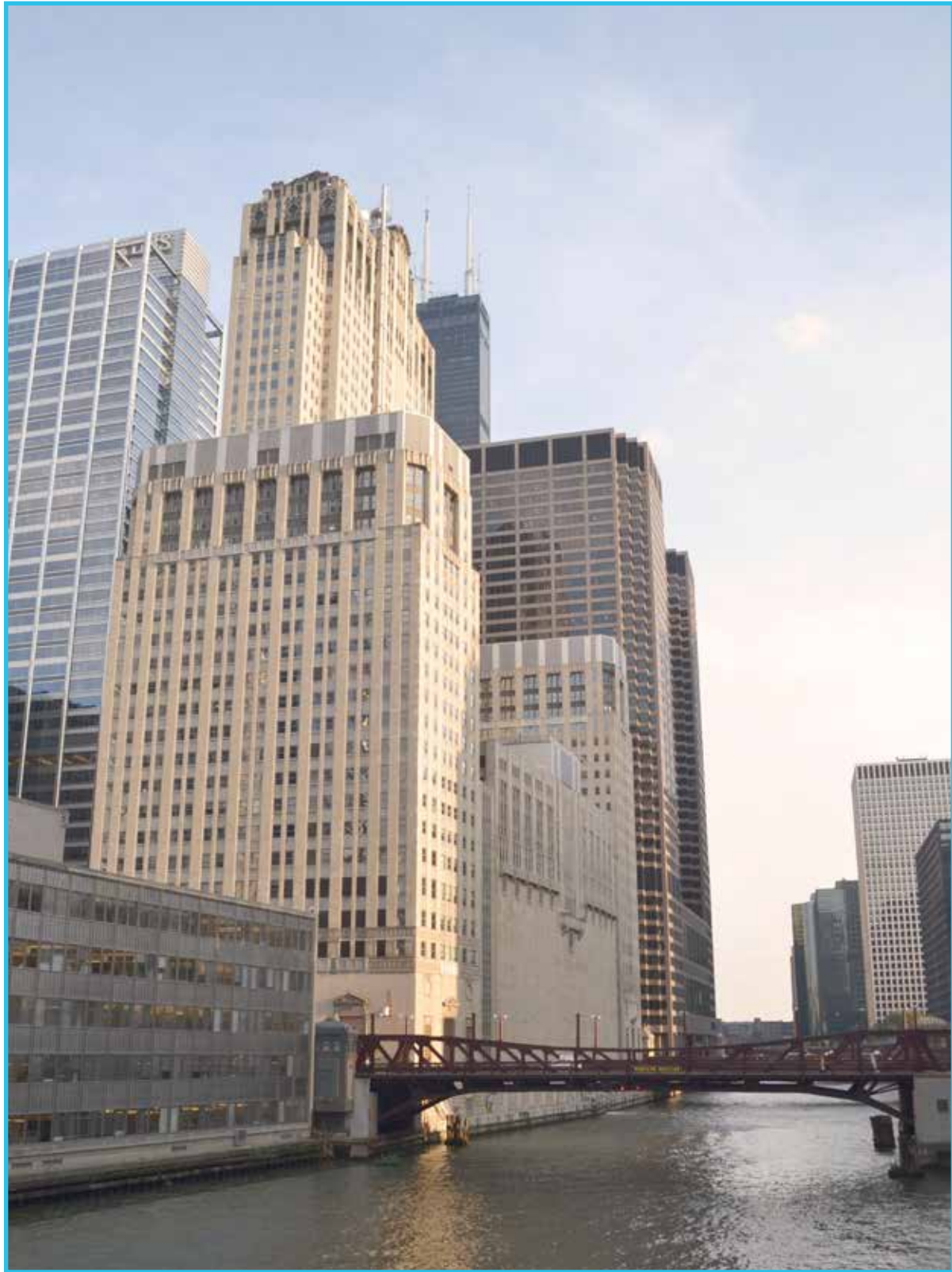
Clockwise from left to right: A) View of 20 N. Wacker. B) Stairs leading to the Washington/Wells CTA stop. C) Local Divvy bike-rental commuters. D) A woman commutes to work by walking. E) View within the Midwest office looking West.