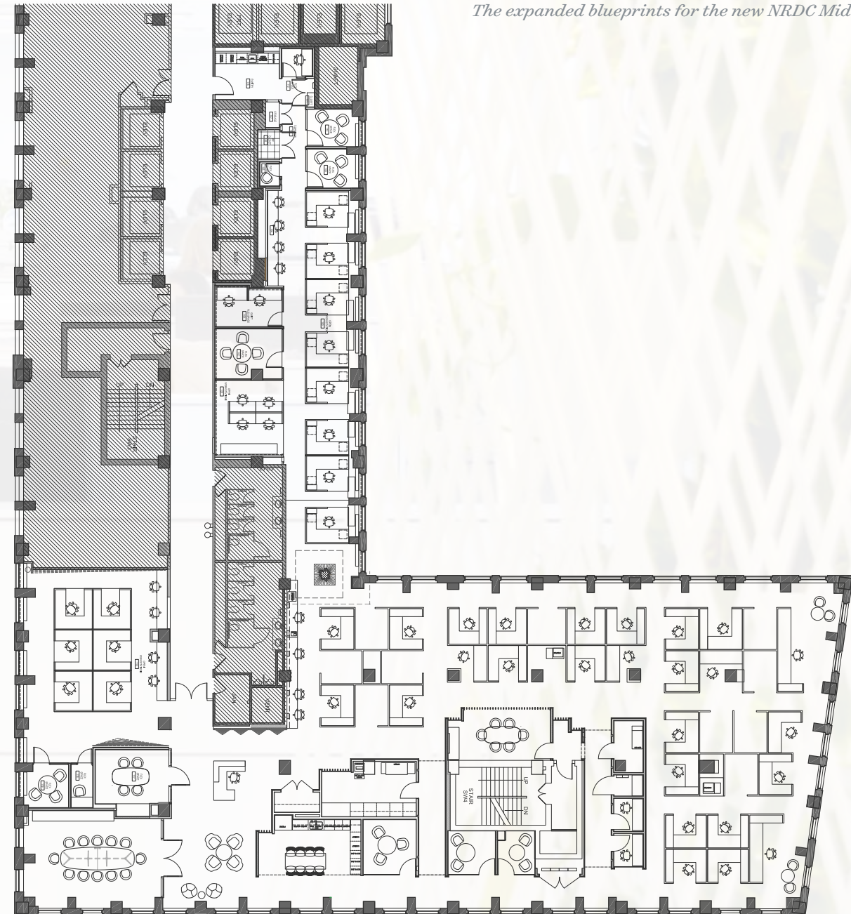
The expanded blueprints for the new NRDC Midwest Office.

Everything from the ceiling to the floors, and all that's between, has been carefully selected in order to make sure that materials and resources place an emphasis on environmental stewardship. Through strategic research, design, and implementation, the Midwest office expansion upholds the identity of NRDC's original Chicago Office as a progressive space that defines a new standard for commercial rehab projects. The Chicago location continues to transcend the idea of a "green space" in commercial renovation sites to something that should be modeled for future planners.