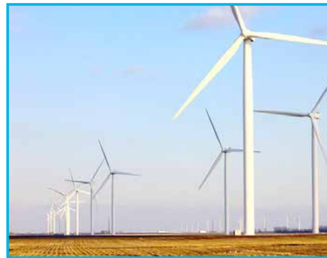
Clockwise from left to right: A) Light fixtures located in the kitchen. B) Natural light entering the office. C) An employee works on their Energy Star certified computer. D) A wind turbine farm in Wolcott, Indiana.