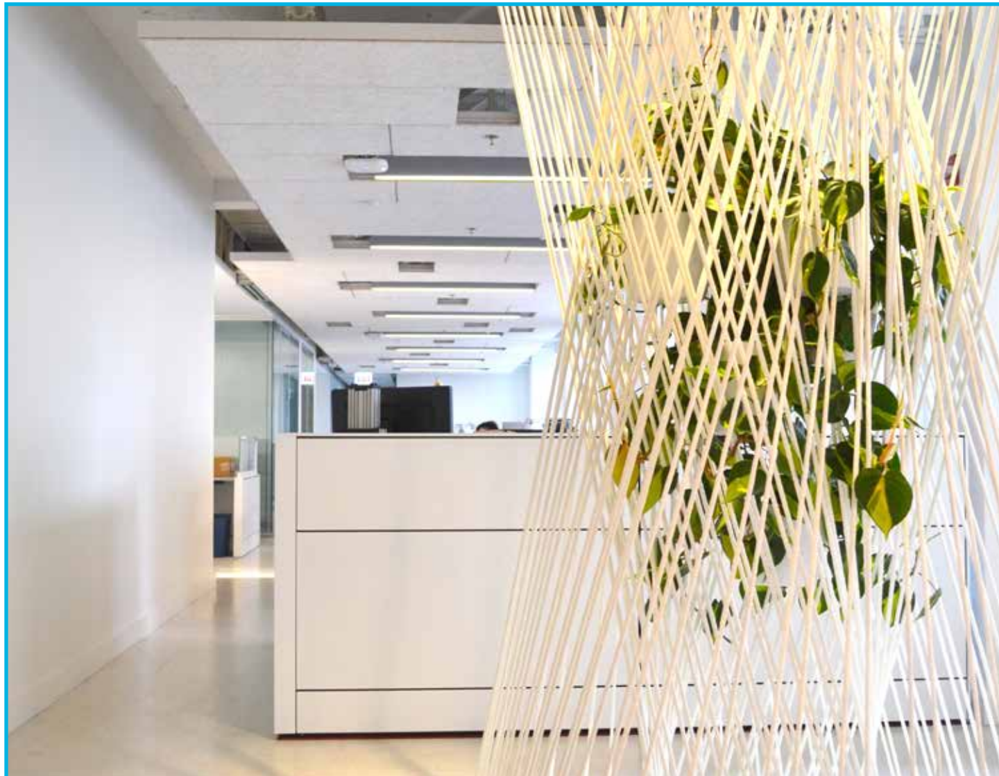
Clockwise from left to right: A) Kitchen table made from sustainably sourced wood. B) Repurposed crown molding used for wood paneling on walls. C) An example of the biophilia in the NRDC office.