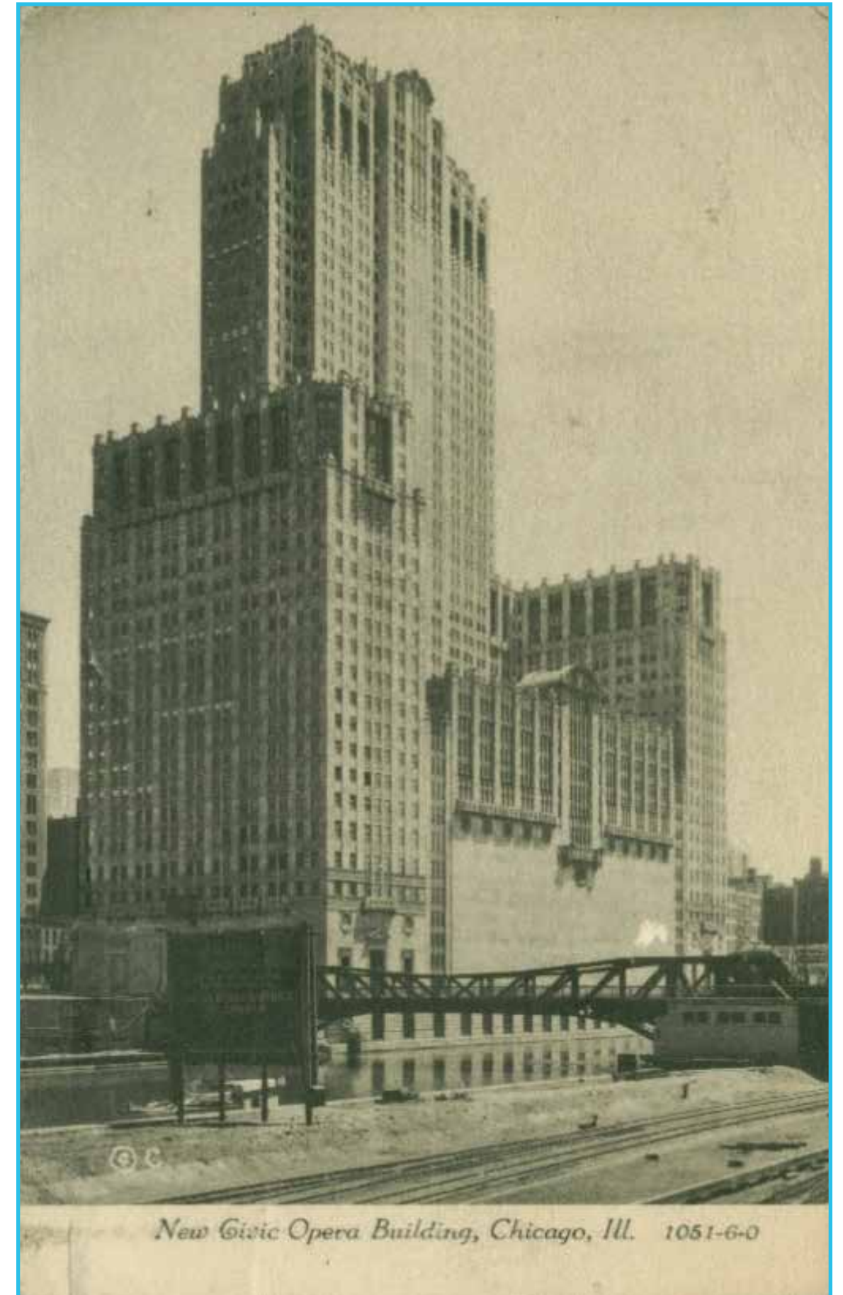
An early 20 th Century photo of Civic Opera House.

The Civic Opera Building, located at 20 N. Wacker, was completed in 1929 and built by Samuel Insull. Insull, a highly successful business mogul, also founded Commonwealth Edison Co., the largest electric utility in Illinois. With its back to river and in grand art deco form, the Civic Opera Building is a perfect symbol of why it's necessary to protect our environment. The NRDC Midwest Program has a dedicated goal to not only restoring the Chicago River, but to providing safeguards for all of the Midwest, ensuring its health and solidifying it as a benchmark for environmental standards internationally.