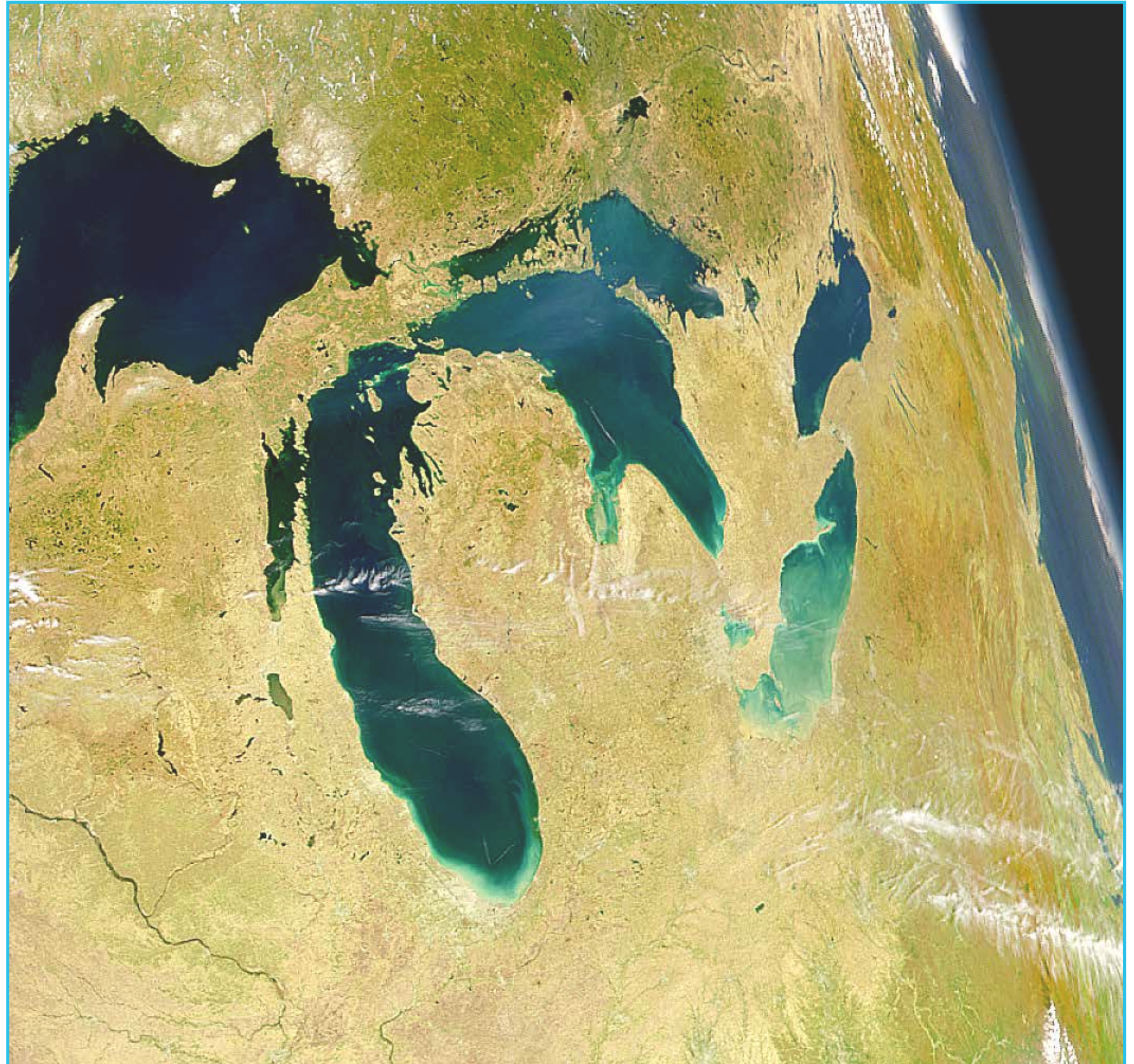
View of the Great Lakes from a NASA Satellite.

We work to foster the fundamental right of all people to have a voice in decisions that affect their environment. We seek to break down the pattern of disproportionate environmental burdens borne by people of color and others who face social or economic inequities. Ultimately, NRDC strives to help create a new way of life for humankind, one that can be sustained indefinitely without fouling or depleting the resources that support all life on Earth.