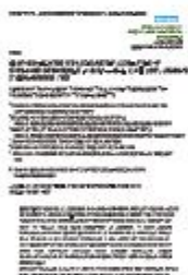
International Journal of Environmental Research and Public Health: A Cross-Sectional, Randomized Cluster Sample Survey of Household Vulnerability to Extreme Heat among Slum Dwellers in Ahmedabad, India (June 2013)