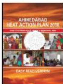
Ahmedabad's Heat Action Plan

Heat Action Plan and Research Materials are available at: http://www.nrdc.org/international/india/extreme-heat-preparedness