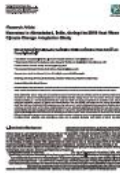
Journal of Environmental and Public Health: Neonates in Ahmedabad, India, during the 2010 Heat Wave: A Climate Change Adaptation Study (January 2014)