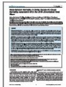
PlosOne: Heat-Related Mortality in India: Excess All-Cause Mortality Associated with the 2010 Ahmedabad Heat Wave (March 2014)