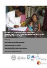
Evaluation of Ahmedabad's Heat Action Plan: Assessing India's First Climate Adaptation and Early Warning System for Extreme Heat