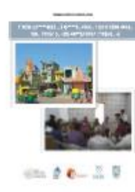
Expert Committee Recommendations for a Heat Action Plan based on the Ahmedabad Experience