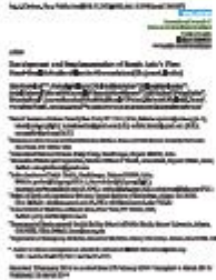
International Journal of Environmental Research and Public Health: Development and Implementation of South Asia's First Heat-Health Action Plan in Ahmedabad (Gujarat, India) (January 2014)