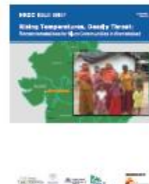
Rising Temperatures, Deadly Threat: Series of Four Issue Briefs of Recommendations for Heat Adaptation in Ahmedabad