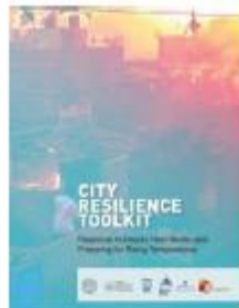
City Resilience Toolkit: Response to Deadly Heat Waves and Preparing for Rising Temperatures