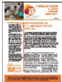
Inside Story: Addressing heat-related health risks in urban India: Ahmedabad's Heat Action Plan