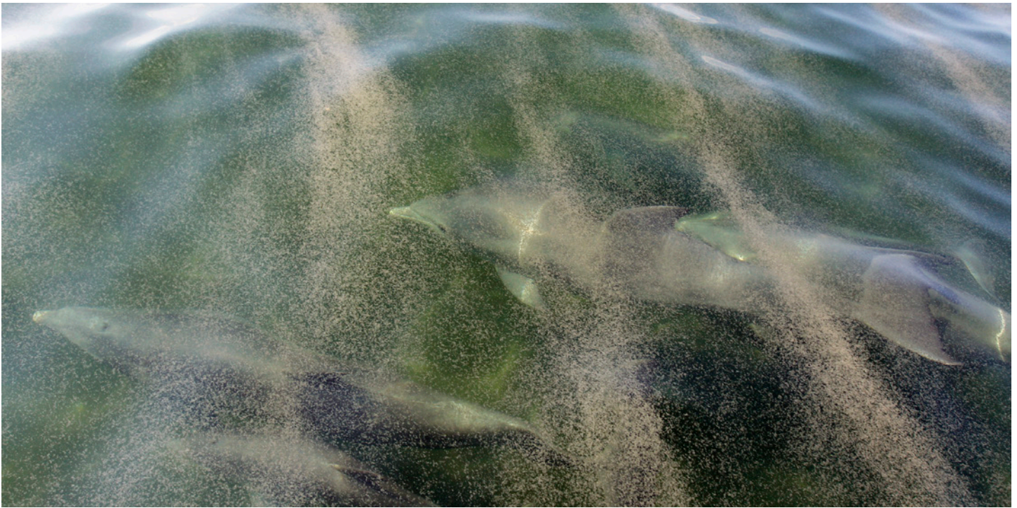
After the Deepwater Horizon explosion bottlenose dolphins were spotted swimming in the oily waters of the Gulf of Mexico.