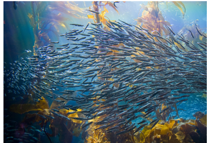
A kelp forest off the coast of California is rich with marine life.