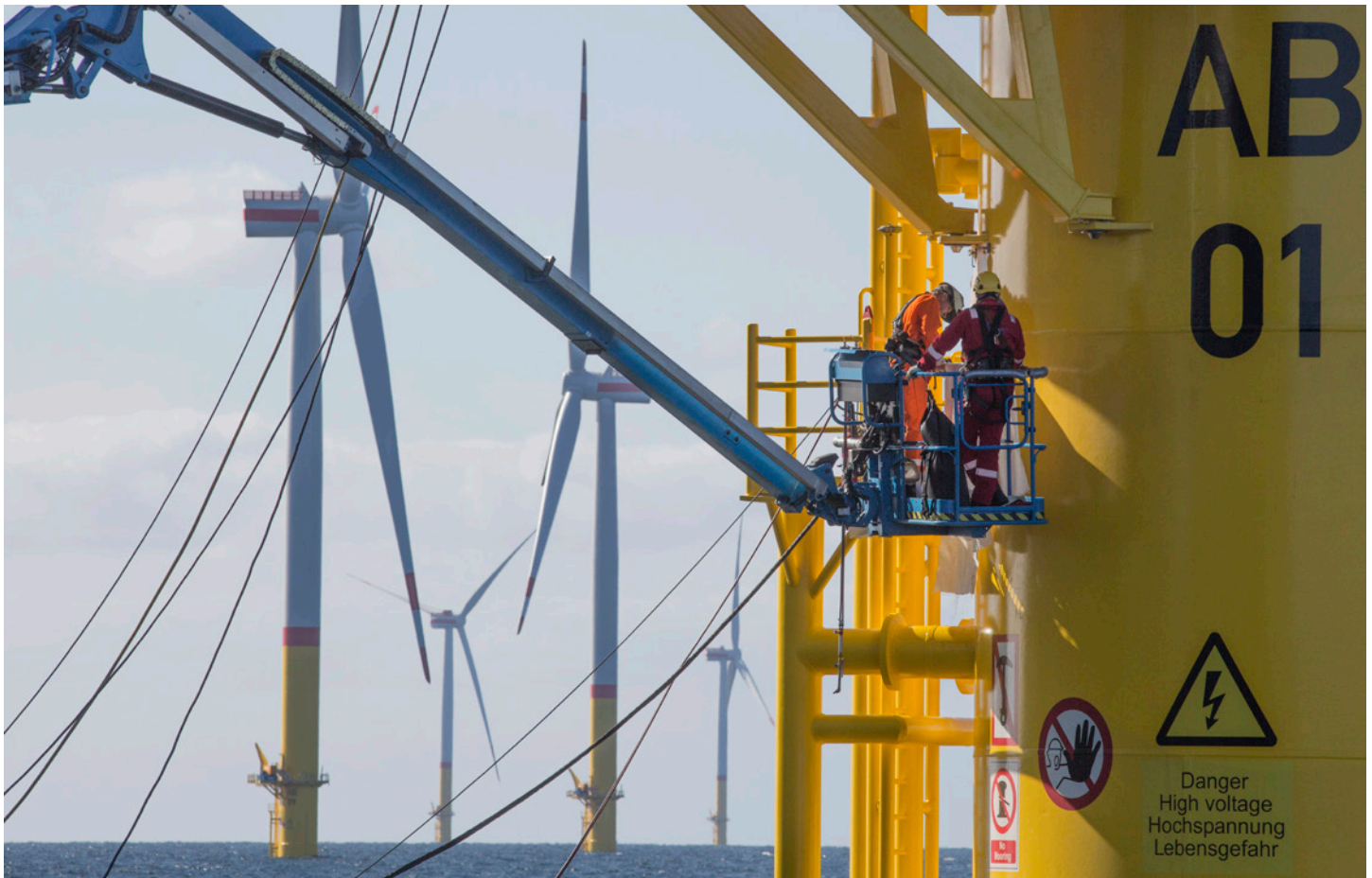
Workers at an offshore wind farm in Germany.