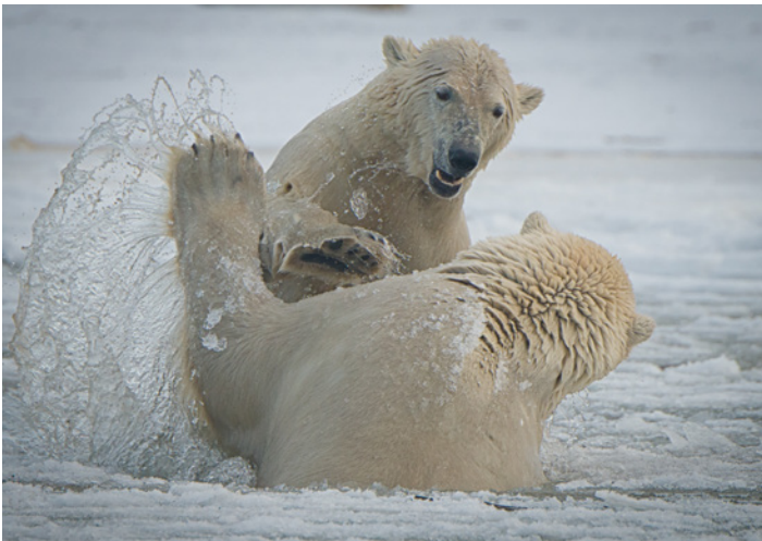
Polar bears tussle in the icy waters of the Beaufort Sea.