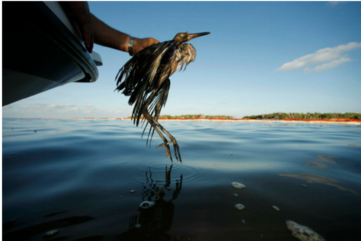
A heavily oiled bird being rescued from the waters of Barataria Bay, LA.