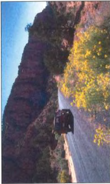
Burr Trail

TRAN-6 All zones will allow hikers, horses, and pack animals, except where noted elsewhere to protect resources.