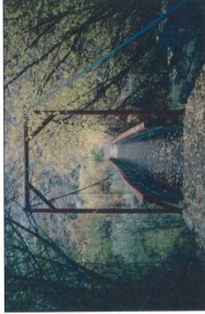
Bridge Across Calf Creek

FAC-7 The development of water may be provided in limited circumstances, where necessary for visitor safety or resource protection, in the Frontcountry or Passage Zones. The provision of water at sites within the Monument will be very limited because the only facilities provided will be modest pullouts, parking areas, trailheads, picnic sites, toilets, and primitive camping areas. These sites do not require water, including most toilets which could use other technologies.