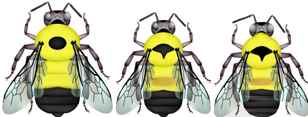
Figure 2. Illustrations of a rusty patched bumble bee queen (left), worker (center), and male (right) by Elaine Evans, The Xerces Society.

Rusty patched bumble bee males are 13 to 17.5 mm in length with a breadth of 5 to 7 mm (Mitchell 1962). Their hair is largely black on the head, but with a few pale hairs intermixed near the top of the head. Black hairs sometimes form an obscure band across the middle of the thorax, otherwise the hair on the thorax is largely pale yellowish. The first two tergal segments have pale yellow hair. Like workers, males usually have a reddish patch centrally and anteriorly located on the second tergal segment of the abdomen. The hair on the rest of the abdomen is black. See Figure 2 for an illustration of a rusty patched bumble bee male.