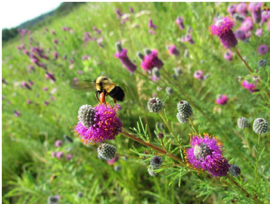
Female Bombus affinis foraging on Dalea purpurea at Pheasant Branch Conservancy, Wisconsin, 2012

AS AN ENDANGERED SPECIES UNDER THE U.S. ENDANGERED SPECIES ACT